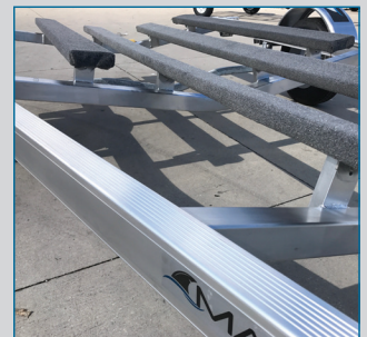
Aluminum Welded Frame