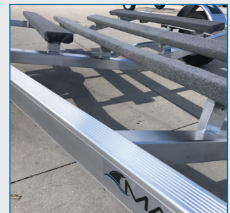
Aluminum Welded Frame