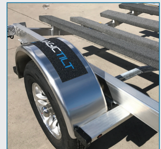
Smooth Aluminum Fenders