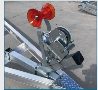
Bow Stop Assembly