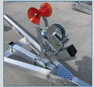
Bow Stop Assembly