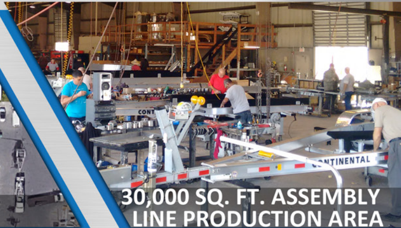
30,000 SQ. FT. ASSEMBLY LINE PRODUCTION AREA