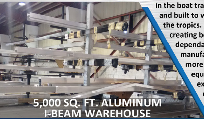
5,000 SQ. FT. ALUMINUM I-BEAM WAREHOUSE

For over 40 years Continental Trailers has been a leader and innovator in the boat trailer industry. Since 1975, our trailers have been engineered and built to withstand the severe saltwater environment of Florida and the tropics. Even with years of experience behind us we are continuously creating better designs and product improvements. Quality and dependability are key features of our trailers. With state-of-the-art manufacturing facilities in Miami and Clearwater, Florida, we utilize more than 60,000 s.f. of building space. Our manufacturing equipment is the most current available and operated by trained, experienced employees who are dedicated to producing top quality products. In order to ensure fast delivery, we have a fleet of 12 delivery trucks that cover Florida daily. So whether you own a 10' jet ski or a 40' powerboat, Continental Trailers has a model to fit your needs.