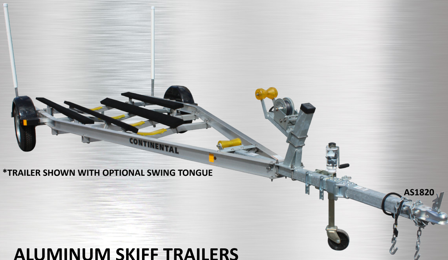
*TRAILER SHOWN WITH OPTIONAL SWING TONGUE