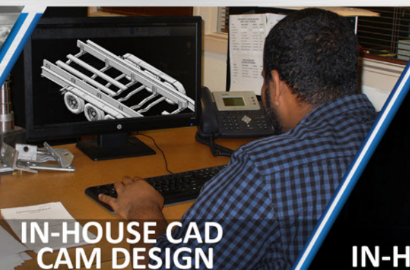
IN-HOUSE CAD CAM DESIGN