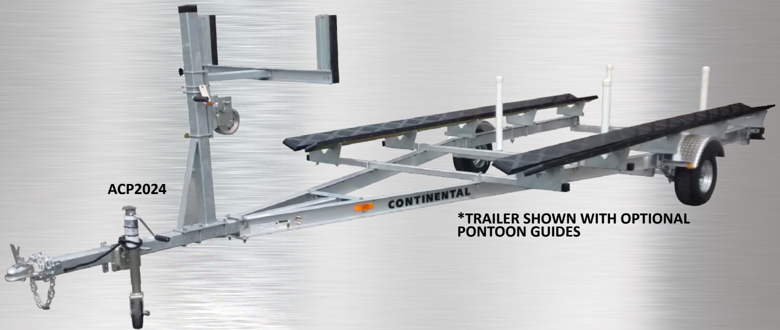
*TRAILER SHOWN WITH OPTIONAL PONTOON GUIDES