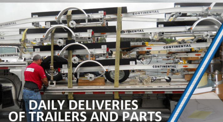
DAILY DELIVERIES OF TRAILERS AND PARTS

For over 40 years Continental Trailers has been a leader and innovator in the boat trailer industry. Since 1975, our trailers have been engineered and built to withstand the severe saltwater environment of Florida and the tropics. Even with years of experience behind us we are continuously creating better designs and product improvements. Quality and dependability are key features of our trailers. With state-of-the-art manufacturing facilities in Miami and Clearwater, Florida, we utilize more than 60,000 s.f. of building space. Our manufacturing equipment is the most current available and operated by trained, experienced employees who are dedicated to producing top quality products. In order to ensure fast delivery, we have a fleet of 12 delivery trucks that cover Florida daily. So whether you own a 10' jet ski or a 40' powerboat, Continental Trailers has a model to fit your needs.