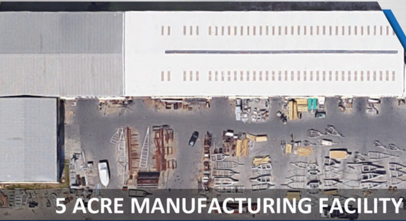
5 ACRE MANUFACTURING FACILITY